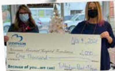
Tottenham Paint and Paper